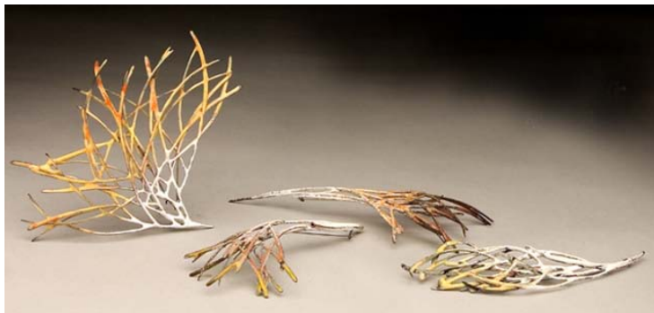
Image: Breath of Nature 2008 - 1,2,3,4