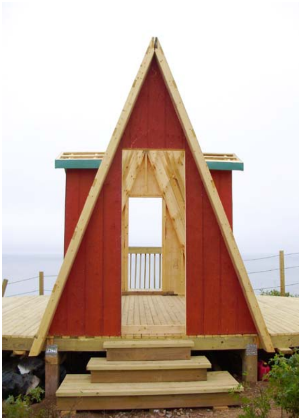
Image: Artist Studio on Dick Lemon's Island