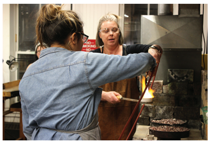
Sandasting Jewellery: ArtFactory I

I hope to gain experience in new mediums. Art is expression. My life is dedicated to expressing one's self. What I want to make always depends on listening to my heart.