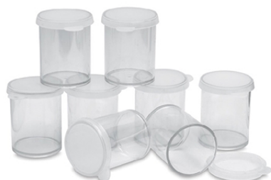
1 or 2 small jars with tight-fitting lids at least 1 inch in diameter