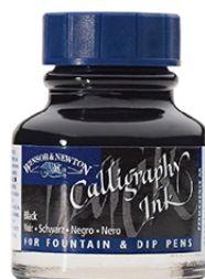
Winsor & Newton Calligraphy Ink [Black]