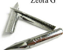
Pointed Pen Nibs Nikko G or Zebra G