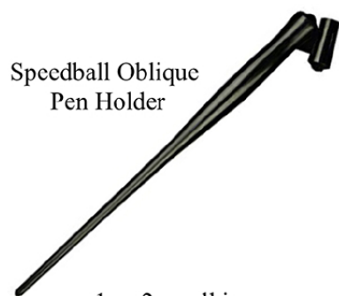
Speedball Oblique Pen Holder